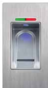
Roto DoorSafe Fingerscan for comfortable, quick door opening: saves up to 150 fingerprints