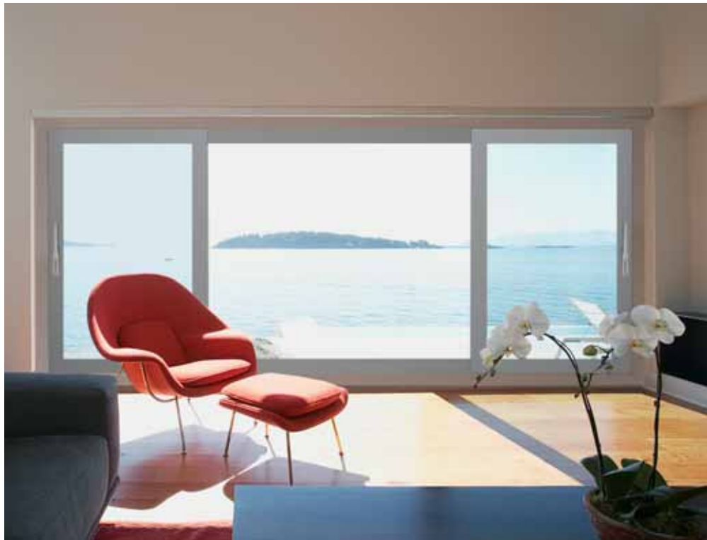
Patio Lift – even heavy balcony doors can conveniently be slid over to the side. In this way, optimum room use is easy

Especially for aluminium profiles, Roto offers the suitable solution. Tilt and slide even heavy sliding elements conveniently and in a space-saving manner with Patio 160 S (automatic) or 200 Z (positive controlled) – quite easy and without excessive force. Patio Lift is our new hardware for Lift&Slide doors up to 300 kg and Patio 6080 opens Fold&Slide doors to its full width – providing generous access to bistros, shops, conference rooms or terraces.