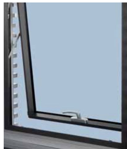
AluVision O Top-Hung solution Optimal ventilation possibility due to large opening angle