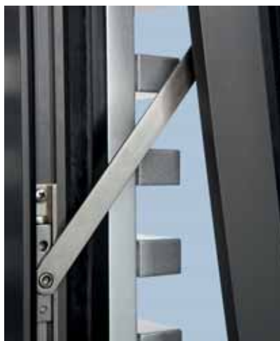
Friction hinges Various sizes and specifications in stainless-steel version