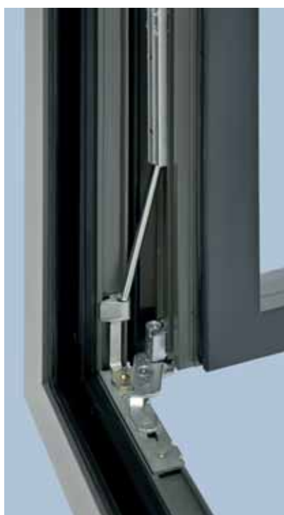
Convenient installation of pivot rest and stay bearing thanks to hexalobular socket T20