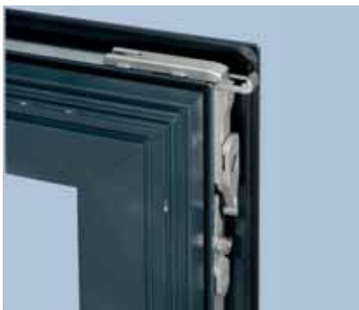
Corner drive with retaining fork