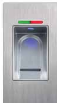
Roto DoorSafe Fingerscan for comfortable, quick door opening: saves up to 150 fingerprints