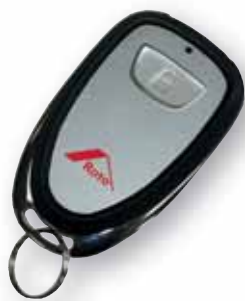
Roto DoorSafe hand-held radio transmitter Compact design with a switch: small, elegant and easy to use